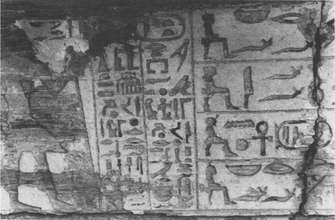
Fig. 3. Names of the deceased in the inscription on the lintel. Tomb of Meref-nebef (Sixth Dynasty), Saqqara.