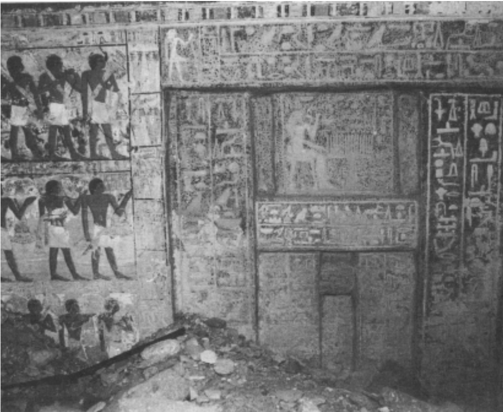
Fig. 4. "False door" in the tomb of Meref-nebef at the moment of discovery.