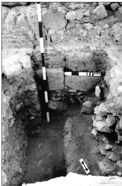
Fig. 2. Villa of Theseus. Pit in the southeastern part of Room 76. View from the north

The results of this investigation confirm the date of construction of the Villa and the fact that it was built upon the northern part of the Hellenistic House. No new data was found to throw light on when the mosaic floors were laid. Therefore, the date provided by the coin of Emperor Valentinian must still be regarded as conclusive evidence.