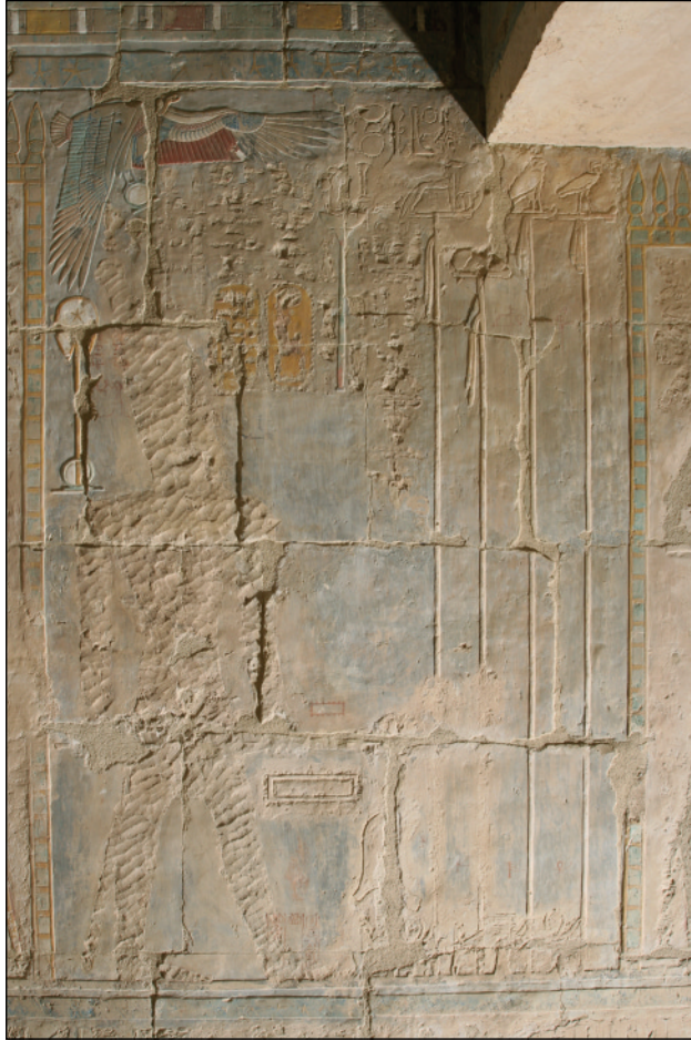
Fig. 1. 'Going Round the Wall' scene on the north wall of the Portico of the Birth