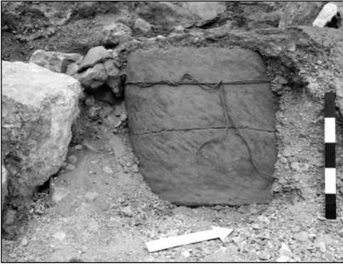
Fig. 4. Storage pithos by the south wall of the hermitage enclosure