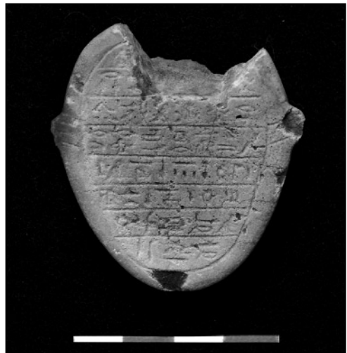
Fig. 6. Faience amulet bearing an inscription from the Book of the Dead on the top and bottom

In the southern part of the hermitage courtyard, excavations revealed part of the rock face, cut vertically in the Pharaonic period and adopted later as a natural border of the hermitage on this side. A round pithos of dried clay, 0.72 m high and 0.87 m in diameter, was found about 0.60 m from this edge [Fig. 4]. Lying on top of a layer of debris inside this storage container were eight Egyptian amphorae of the LRA 7 type. They were all empty, except for one which contained an empty leather pouch among organic remains [Fig. 5]. Outside the pithos there was a reused censer most probably from the Late Period and six LR 7 amphorae lying around it.