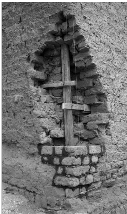
Fig. 8. Tower B during the restoration of the corner, viewed from the south

and table ware. Directly next to the wall, a kind of bench for sitting or sleeping was uncovered with a row of mud bricks running around it. It would have been covered with a mat or loose rushes.