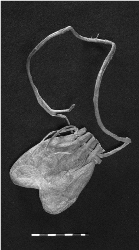
Fig. 5. Leather pouch from an amphora in the pithos

to the top throughout this period and was not excavated until modern times. The rubble filling the bottom end of the shaft and the corridor branching off horizontally from it, the entrance to which could be discerned above the top of the rubble in the east wall [Fig. 3], made it impossible to determine whether the chamber it had led to was ever completed as a burial place.