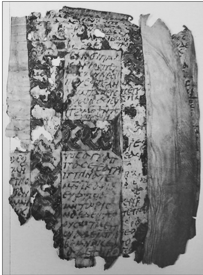
Fig. 2. Parchment card with the text of the Martyrium Petri