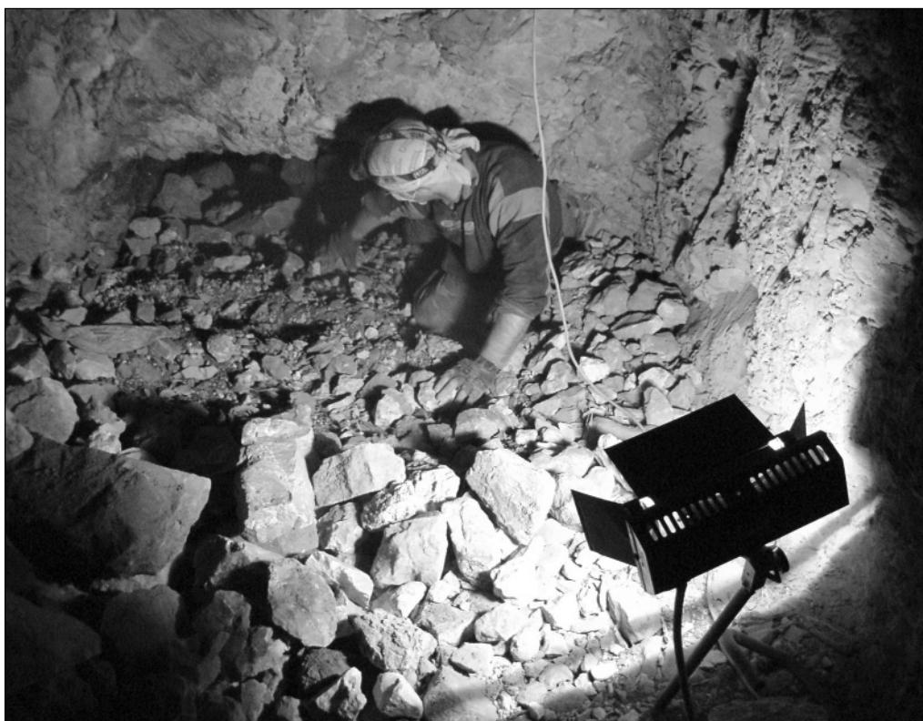
Fig. 3. Bottom of the shaft in T 1152 with entrance to further parts of the tomb at left back

and blocks of stone. The current depth of the shaft is c. 18 m counting from the edge around the opening to the top of the rubble fill, which presumably goes down even further (possibly at least another 8 m). 4 The examination of the feature did not give a clear answer as to whether the shaft had been empty or filled with debris at the time that the Coptic hermitage was installed in the tomb. A number of premises indicate that it was rather filled