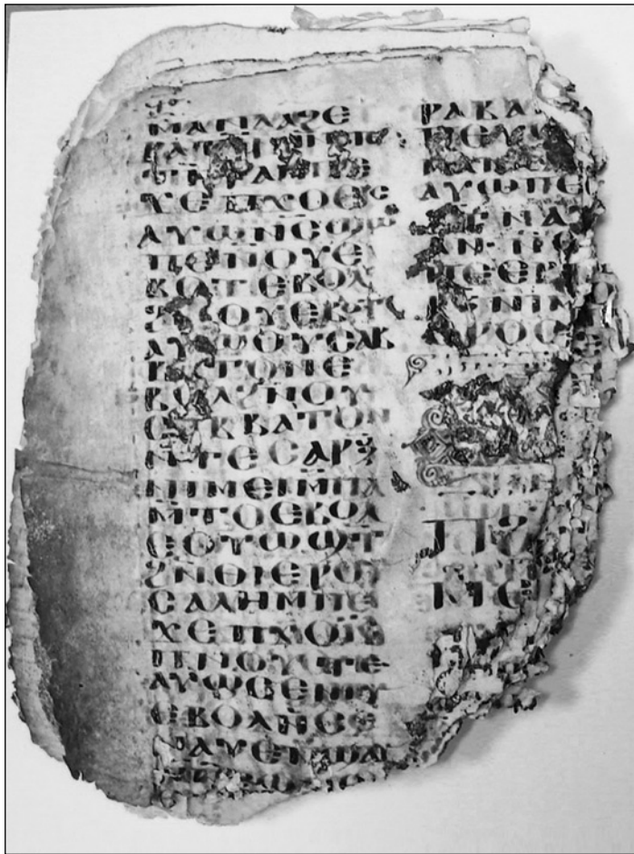
Fig. 1. Parchment card with a fragment of the Coptic text of the Book of Isaiah