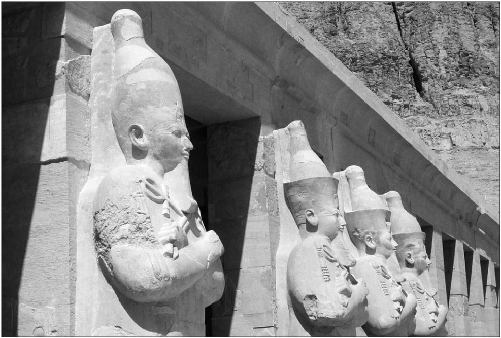
Fig. 3. Reconstructed Osirides in the Coronation Portico