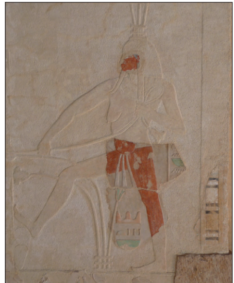
Fig. 2. Sema-tawy scene from the Bark Hall, after reconstruction with a new fragment

RECONSTRUCTION OF HATSHEPSUT'S SPHINX STATUES The 4500 fragments of sandstone sphinxes brought to the Hatshepsut Temple lapidaries were documented (see Smilgin 2012, in this volume) and subjected to preliminary conservation (by conservator Andrzej Sośnierz).