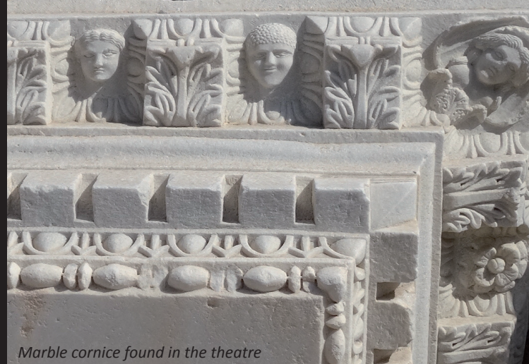
Marble cornice found in the theatre

In the 4th century, when the Empire was ruled by Constantine and his sons, the area became one huge construction site. A visionary urban master plan engaged substantial public funds and the best architectural minds of the empire, creating a zone that must have been the centre of social life in the Late Antique city. A monumental complex of public buildings was constructed around a grand Imperial bath complex 3 that was one of the finest edifices of its time. The bathing halls could have welcomed hundreds of bathers at any given time. The complex included also palaestrae for physical exercises, colonnaded passages, and such amenities as public latrines. Water was supplied from a huge masonry cistern 6 and heated by a complex system of furnaces and pipes.