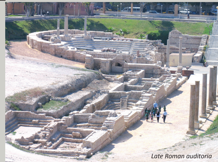
Late Roman auditoria

The biggest hall of this complex was a large theatre-like structure 1 situated at the southernmost end of the colonnade portico. This landmark structure must have originally operated as an odeum, where the social elites of cosmopolitan Alexandria enjoyed musical performances.