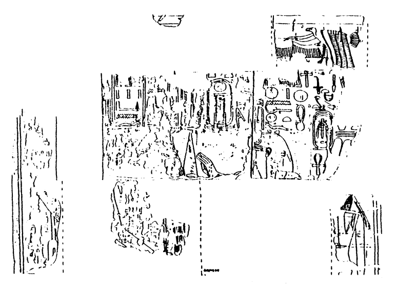
Fig 2. New fragments from the wall with niches.

In addition, the recording of the wall with niches in the upper court was started. All the scenes above the smaller niches were traced as well as the largest, unpublished scene to the south of the sanctuary entrance. During studies in the temple stores eight additional fragments were identified; they belong to the wall with niches and their exact location has been established (Fig. 2).