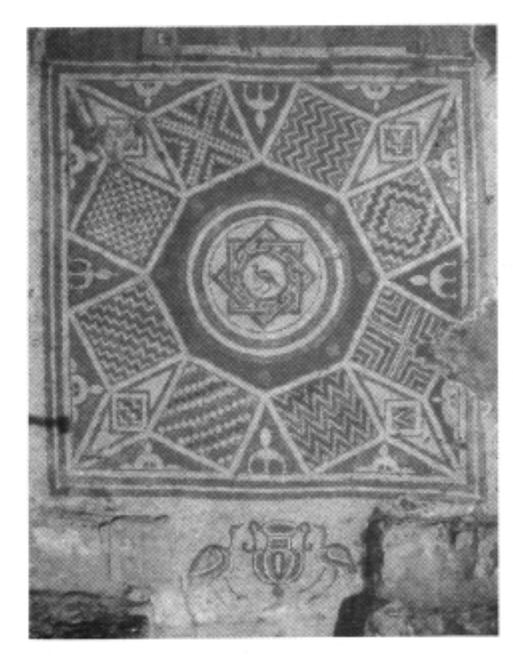
Phot. 3. Basilica, mosaic in the western part of the nave.