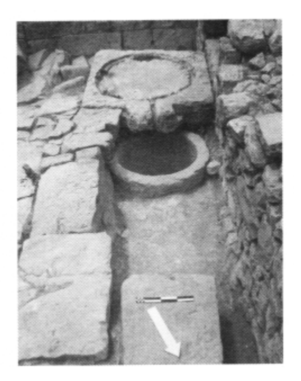
Phot. 4. Oil-press complex E.1: northern press.