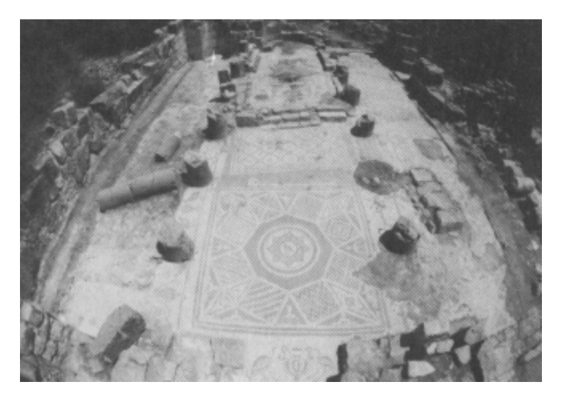
Phot. 1. Basilica, general view.

Most of the mosaics are geometric. A composition of polychrome lozenges and squares enclosed in a border of leaves was found in the southern aisle. A panel in the western part of the nave contained geometrical figures concentrically arranged around a bird representation in the centre. Another mosaic panel, originally surrounded by a chancel screen, marked the space that was reserved for the clergy in front of the bema. Representations of birds and a variety of vessels filled the spaces between the columns. The mosaic in the sanctuary comprised a central panel decorated with a magnificent depiction of a lioness, surrounded by water-birds, fish, baskets brimming with bunches of grapes (Phot. 2). The iconography of the mosaics reveals many common features with the other churches of the Byzantine province of Phoenicia, the complexes in Zahrani and Ghiné constituting good examples.