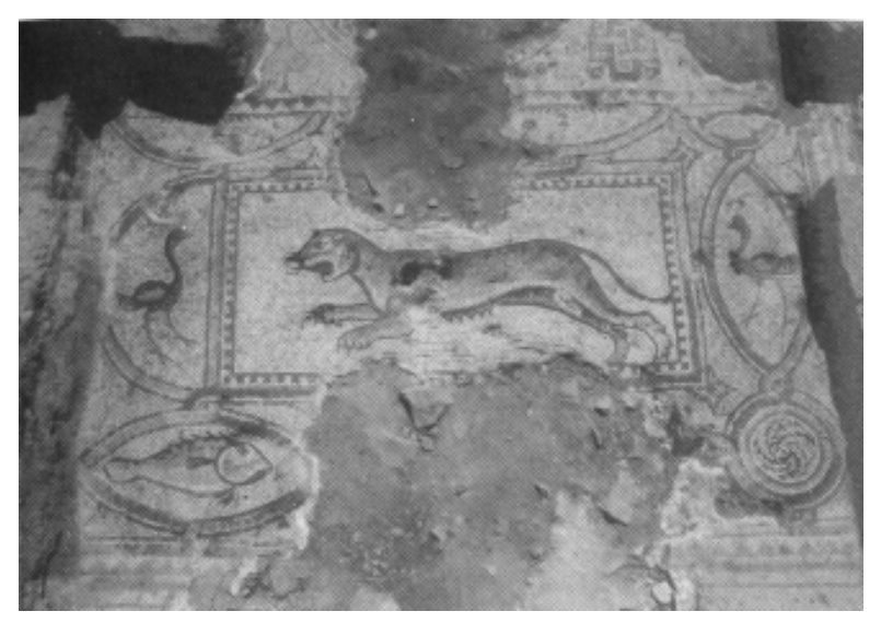
Phot. 2. Basilica, fragment of a mosaic with a depiction of a lioness.

Important evidence of remodeling in the sanctuary, that is, the dismantling of the chancel screen and the blocking of spaces between the columns, presumably corresponds to changes in the liturgy.