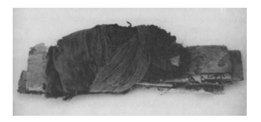
Fig. 2. Archive of Girga ben Bifam. Documents on paper.

cut rather roughly but originally finished with mud plaster. It was presumably a bedroom. Access was aided by a small step below the entrance. The entire unit J seems to have been prepared rather hastily and its slightly different arrangement, compared to unit G, appears to have been imposed by the condition of the sedimentary rock, which is particularly fractured in this area.