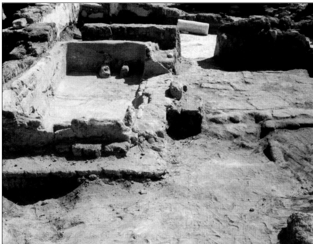
Fig. 2. Site D. Room D.28 with basin, view from the west

From the courtyard D.24 an entrance led to a small room, D.29, measuring 3.55 x 4.26 m. It had a solid wooden door with an inside lock in the form of a wooden beam 186 cm long, sliding into a slot in the eastern wall. A similar blocking of the entrance had been recorded in the southern of the two towers (DB.II). The only furnishing of this wall was a structure by the south wall, distinguished by a large storage vessel