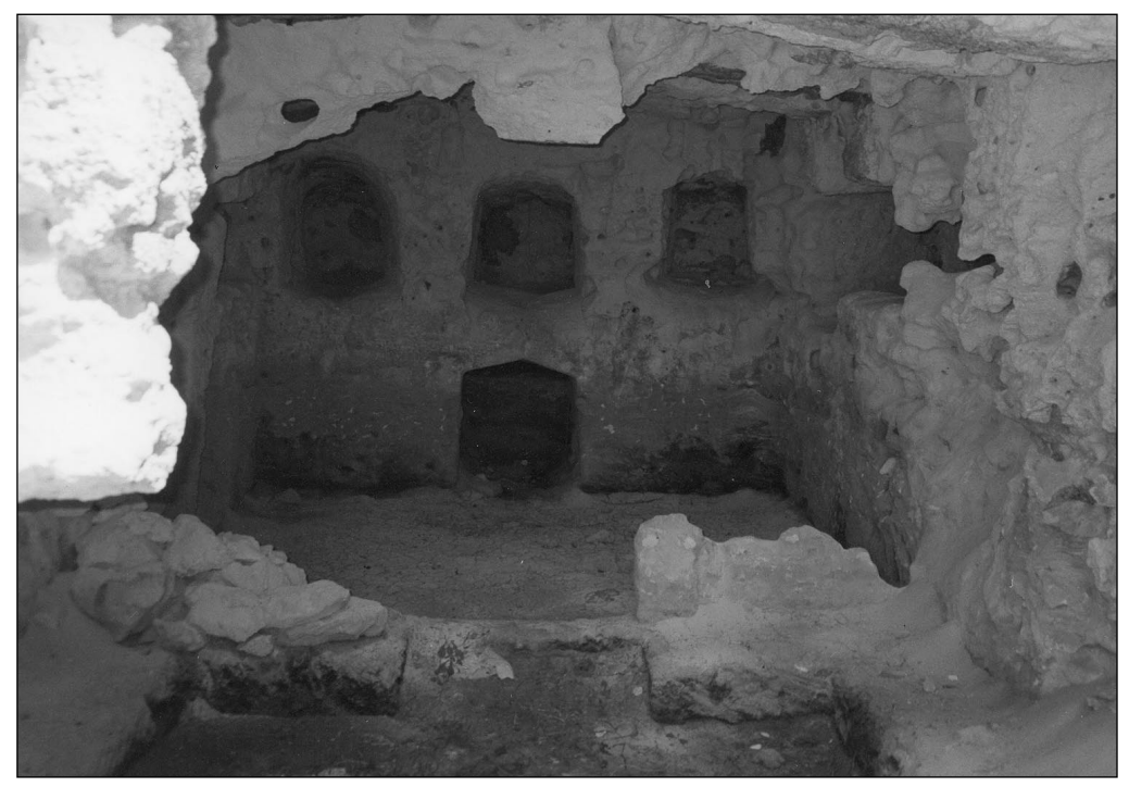
Fig. 1. The chamber of one of the rock-cut tombs at Dekheil

In the funerary chamber itself, the loculi are hewn in the rear and lateral walls, parallel to one another in horizontal rows ( Fig. 1 ). Usually, the loculi were cut into the rock, so that their short sides opened onto the chamber. They were rectangular in section, sometimes with a "gabled" roof. A few loculi were cut sideways, opening onto the chamber with the long side. The whole tomb arrangement