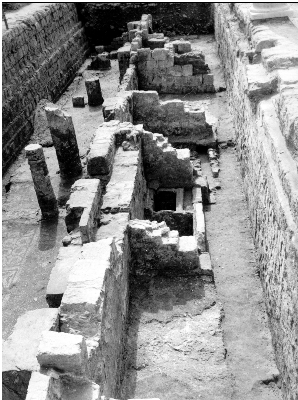
Fig. 5. Sector M. Remains of an Early Roman house. View from the north