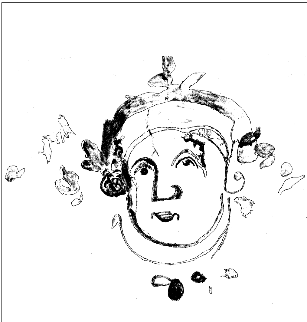
Fig. 9. Sector M. Early Roman house. Painted motif of a woman's head on a wall in room 14 (Drawing W. Kolataj)

reasonably be expected in the layers sealed by the mosaic floor. Hopefully, an investigation of these layers wherever possible will provide the missing chronological clues.