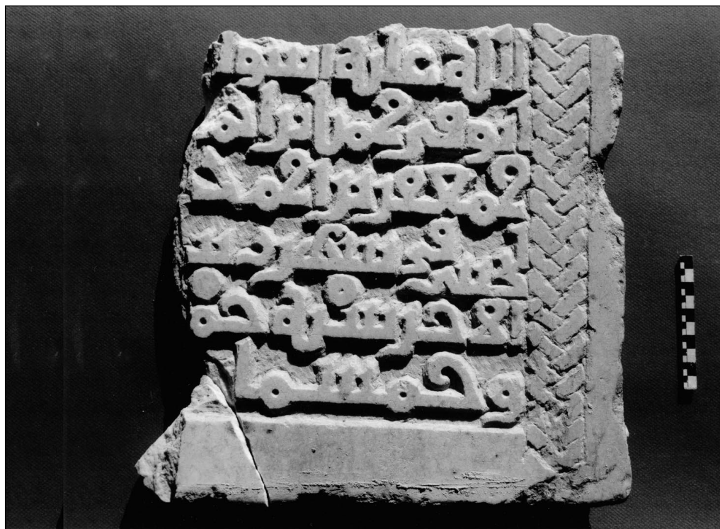
Fig. 3. Sector E. Funerary stela fragment, no. 5064

This year's large-scale clearing of the topmost cemetery layer in Sector E prepares the ground for comprehensive exploration to follow in the next campaign.