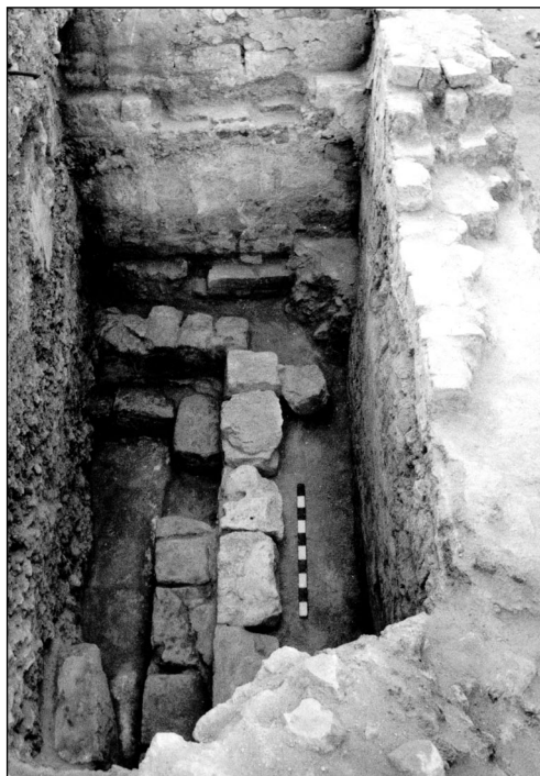
Fig. 4. Sector H. Fragment of a Late Roman auditorium. View from the north

Small areas of the portico paving were cleared. Both of the two superimposed levels of flagstones have been damaged seriously by medieval burials. Each of these levels corresponds to subsequent building phases of the portico. Portico rebuilding is also evidenced by signs of restructuring that are clearly discernible in the stylobate. In the initial phase, the columns were standing on low pedestals lined with marble tiles. In the next phase, the intercolumnar spaces were filled with two additional courses of large blocks corresponding to the raised paving. One broken column shaft was excavated last year near tomb M 299. Hopefully, more columns will be found sub situ .