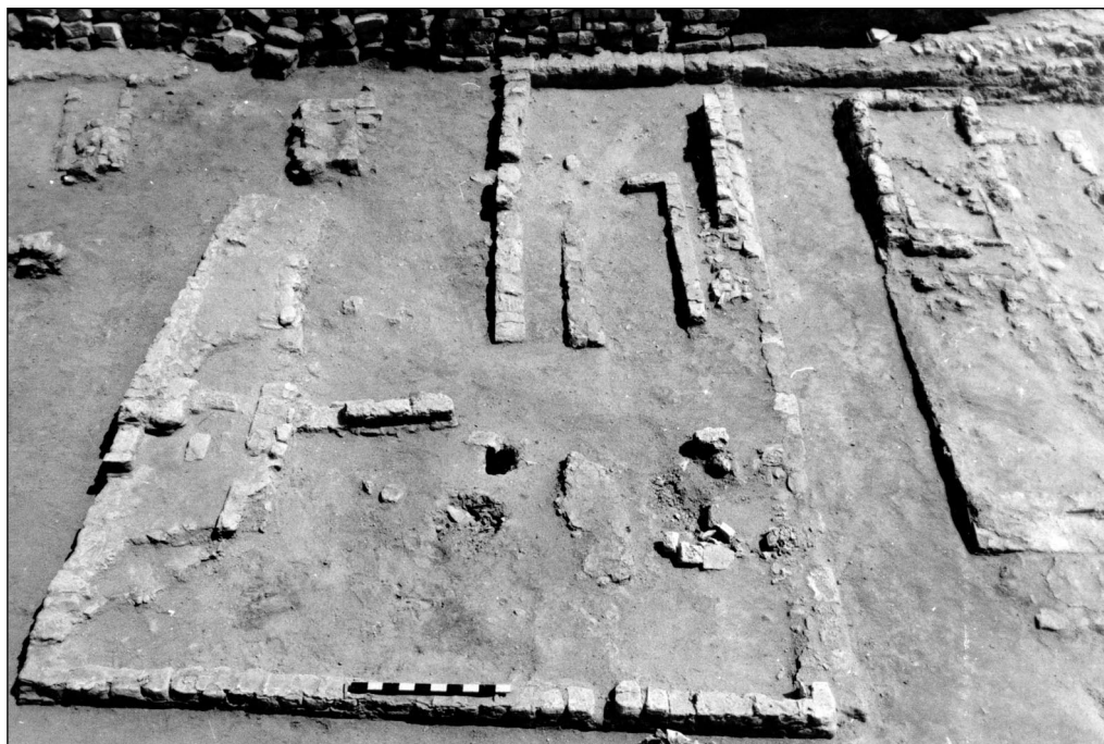
Fig. 2. Sector E. Moslem Upper Necropolis, enclosure E 17. View from the west

The associated layers yielded the usual range of assorted finds, largely similar to that recorded previously in other medieval