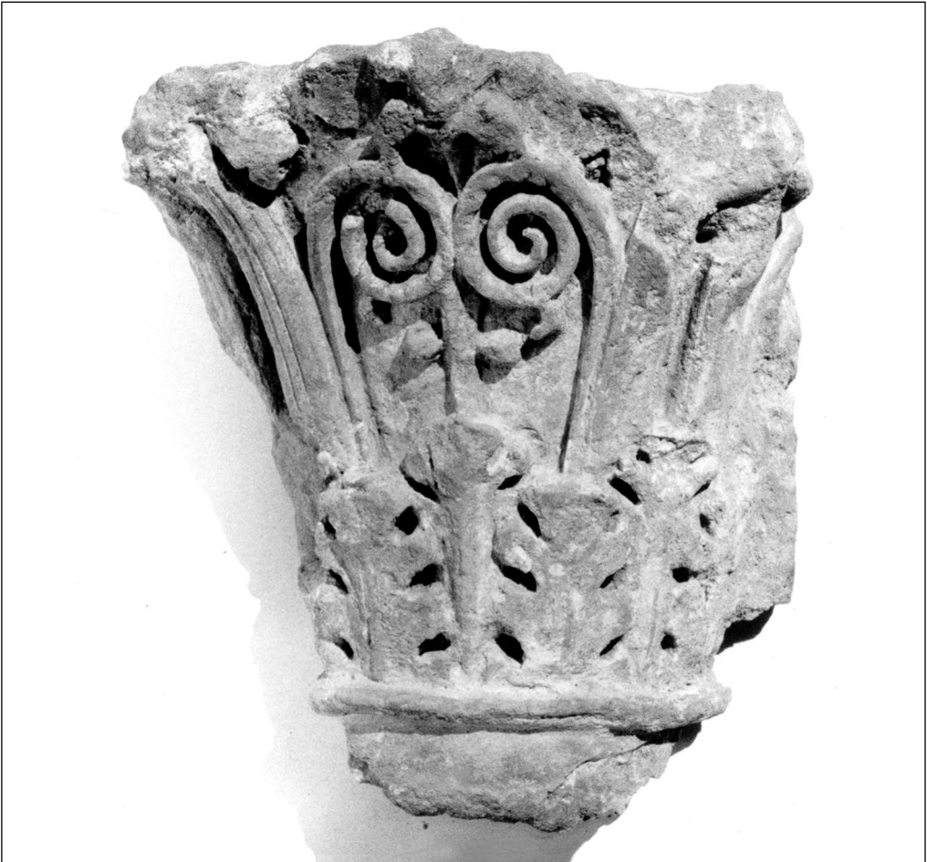
Fig. 6. Sector M. Limestone capital originating from the Early Roman house

Taken as a whole, the available evidence indicates that the building must have been destroyed in the late 3rd century AD. Whether this had been a natural catastrophe, perhaps an earthquake, or whether it was linked to the destruction inflicted on large sections of the town following Palmyrean occupation in AD 270 or the siege laid to the town by Roman imperial forces in the reign of Diocletian (AD 297), will have to remain