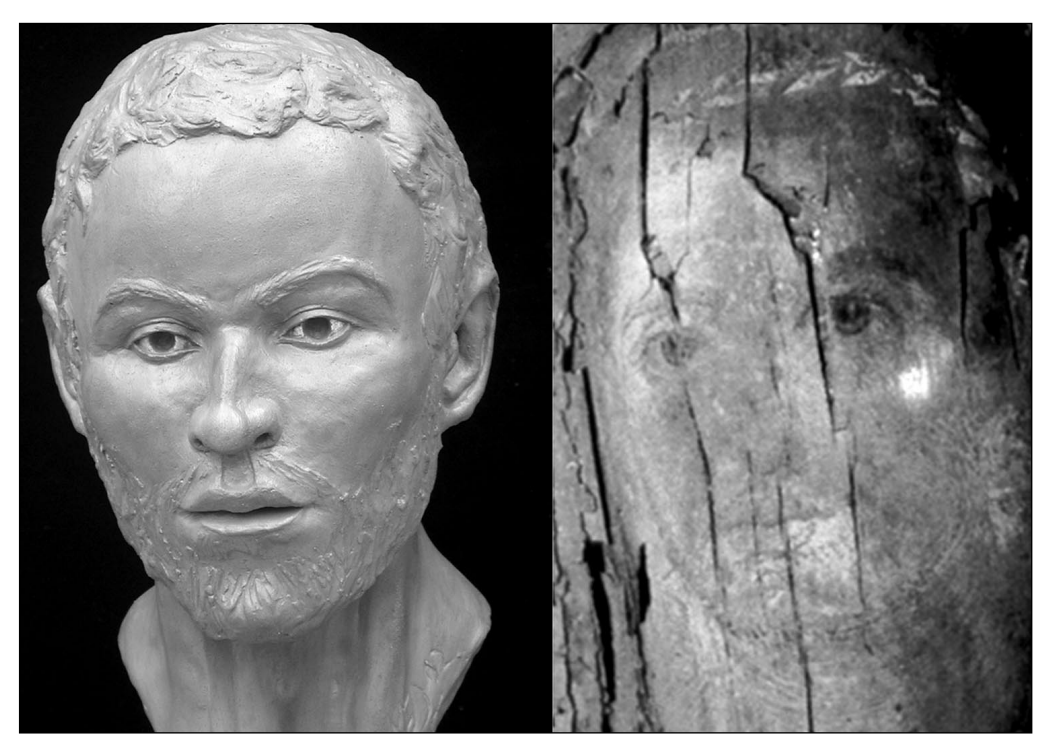
Fig. 4. The Marina Mummy: life portrait on left, portrait painted on wood from the burial on right

In conclusion, this study suggested that the portrait was a reliable indicator of the appearance of this individual in life, and proved to be another interesting addition to the portrait-facial reconstruction research series.