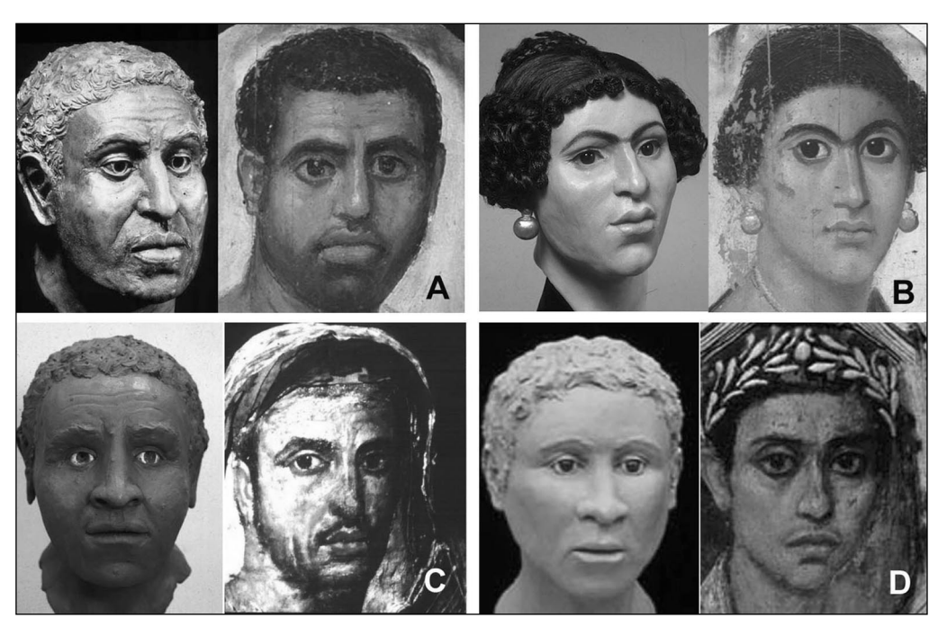
Fig. 1. Mummy portraits and their facial reconstruction: A and B – male and female from the British Museum collection; C – male from the Carlsberg Glyptotek collection; D – male from the Metropolitan Museum of Art collection