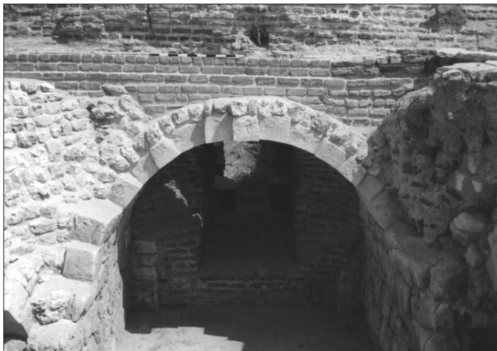
Fig. 10. Roman Baths. Vault of the underground area after restoration

Some supplementary conservation work was also undertaken in the Villa of the Birds which had been restored in 1999. 11 The mosaic with panther ( \alpha -6) had been seriously endangered last year by water seeping from a nearby broken pipeline, causing a most dramatic resurgence of the effects of increased damp. Instead of detaching the mosaic, it was decided to treat it in situ . The efflorescence of water-soluble salts appearing on the surface was carefully removed mechanically and the surface was rinsed with 5% ammonia. To assure unimpeded drainage, piping was introduced into the mosaic substructure, c. 30 cm below