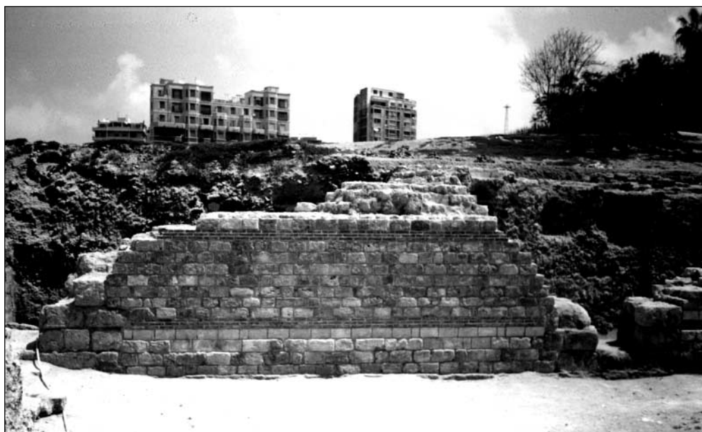
Fig. 9. Theatre Portico. Segment H of the back-wall, after restoration