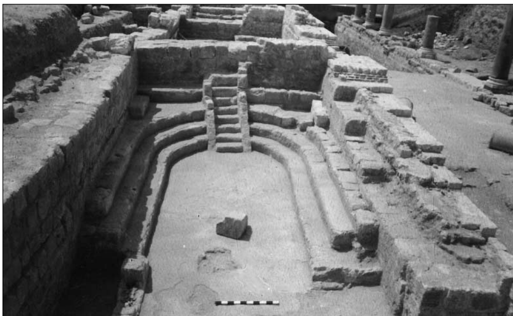
Fig. 5. Late Roman Auditorium K, view from the north