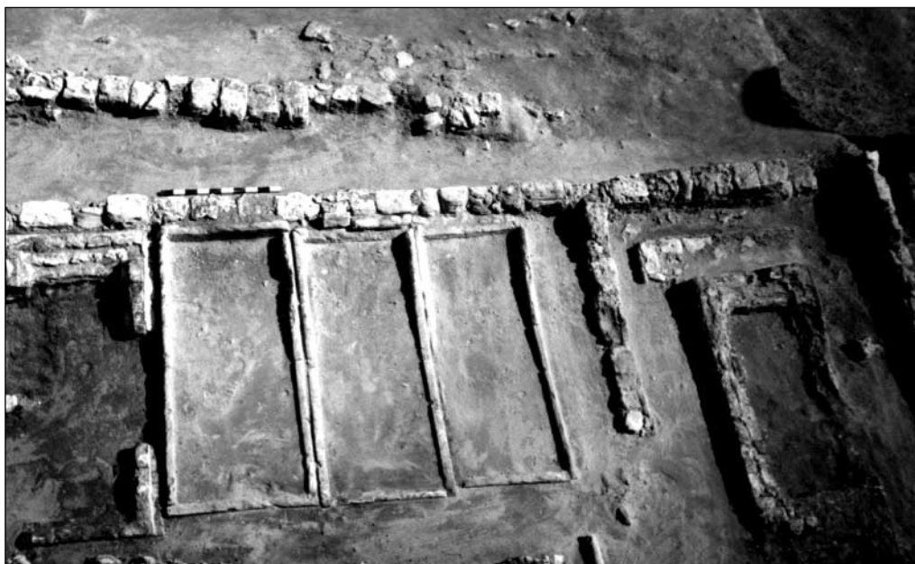
Fig. 1. Area E. Moslem Upper Necropolis, graves E 42-45. View from the west