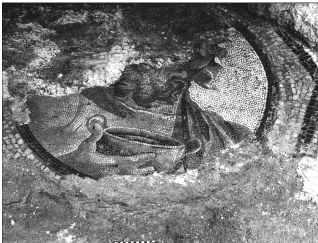
Fig. 7. Figural emblema from the mosaic found below the theatre

Finally, mention should be made of a number of artifacts found in good condition in the fill removed from a subterranean vaulted cellar in the Baths complex, excavated prior to undertaking the planned preservation work. Two glass vessels and two complete lamps were recovered from a thick layer of ashes accumulated under the vaults near the furnaces. 9) All the finds, accompanying pottery were dated to the 5th century AD and should be considered as referring to the second building phase of the Baths.