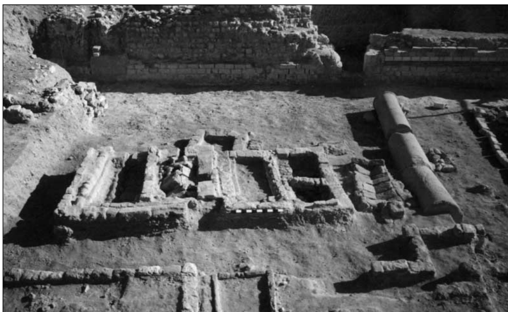
Fig. 2. Area E. Moslem Upper Necropolis, graves E 33-35. View from the west