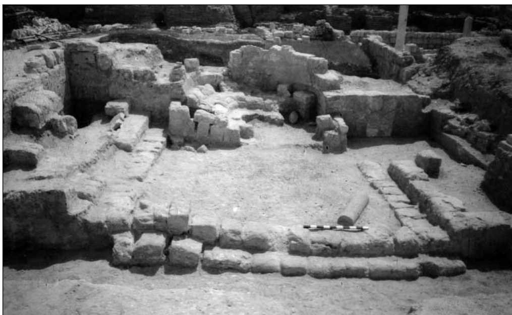
Fig. 6. Late Roman Auditorium P