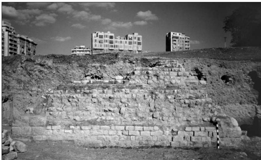
Fig. 8. Theatre Portico. Segment H of the back-wall, before the 2002 restoration