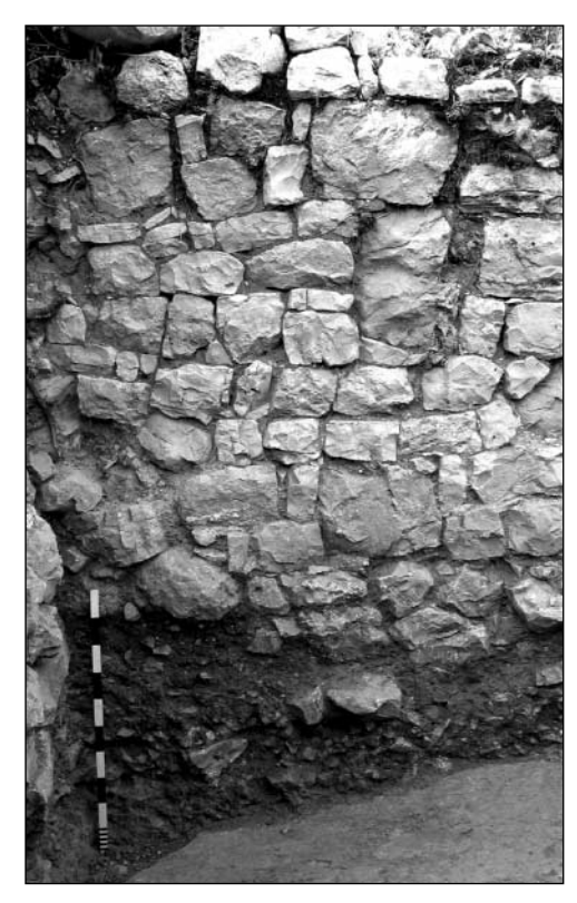
Fig. 4. Section through the stratigraphy in the northwestern corner of E.XVI

Room E.XVII (4.00 x 4.10 m), which adjoins E.XVI from the north, was excavated in 2002. This year a trial pit was dug in the northeastern corner and revealed two layers beneath the Roman-period floor. The younger one contained Roman and