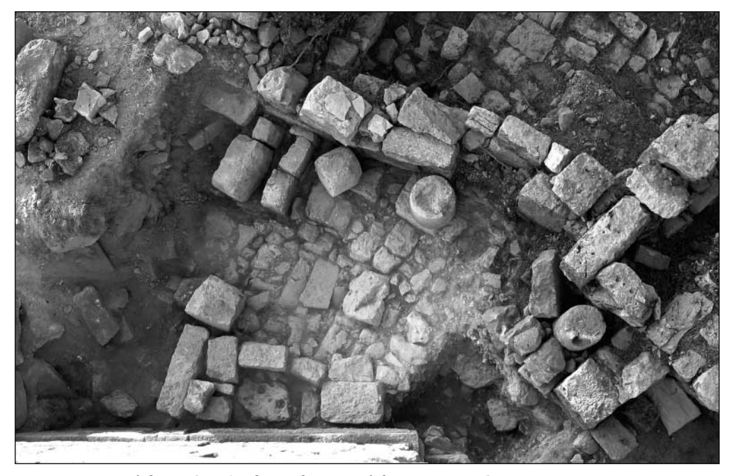
Fig. 3. View of the trial pit by the north corner of the Roman temple

a meter-thick layer of modern fill (cf. Fig. 1 ; Fig. 3 ). The function of these four limestone steps appears clear. The steps are c. 0.90 m wide with side walls on the