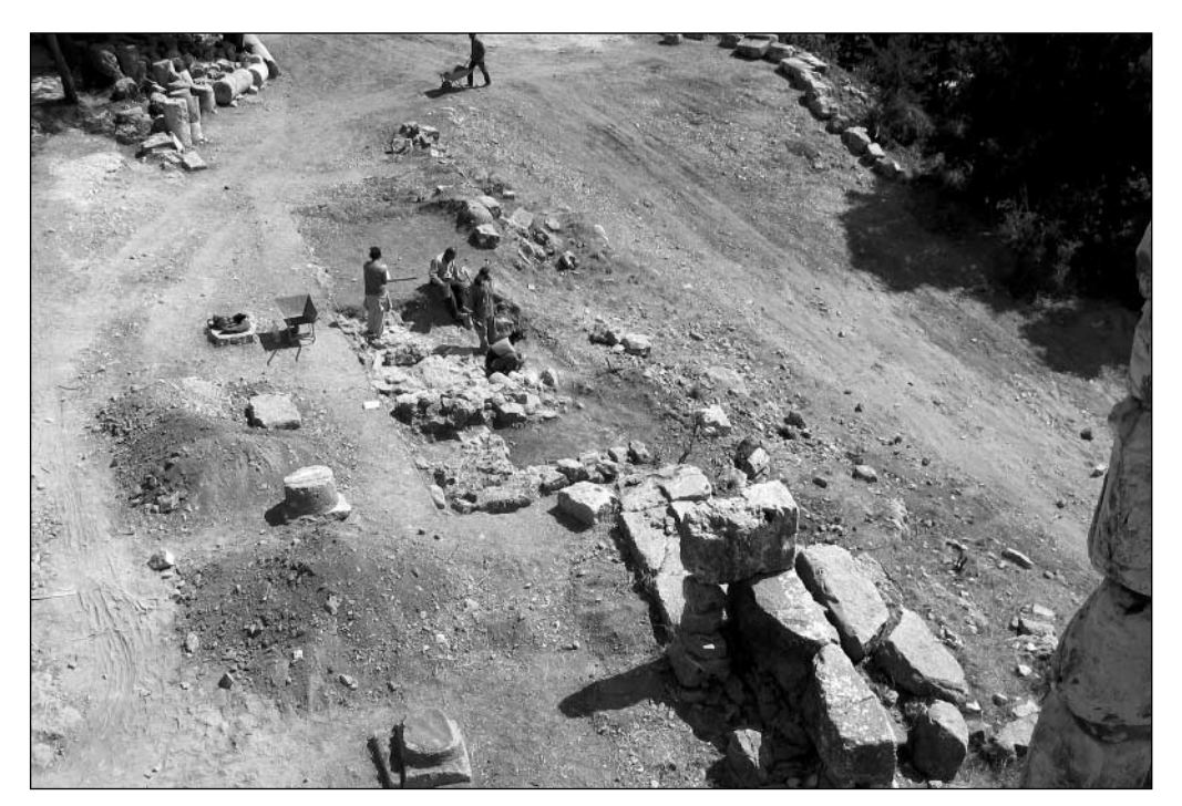
Fig. 2. Structures discovered in the court in front of the Roman temple, view from the northwest

Two walls of c. 0.90 m width were attached to the south side of this structure. They constituted reinforcement of the portico wall or, equally likely, formed small rooms. In either case, they buttressed the portico on the side of the escarpment. Their connection with the neighboring