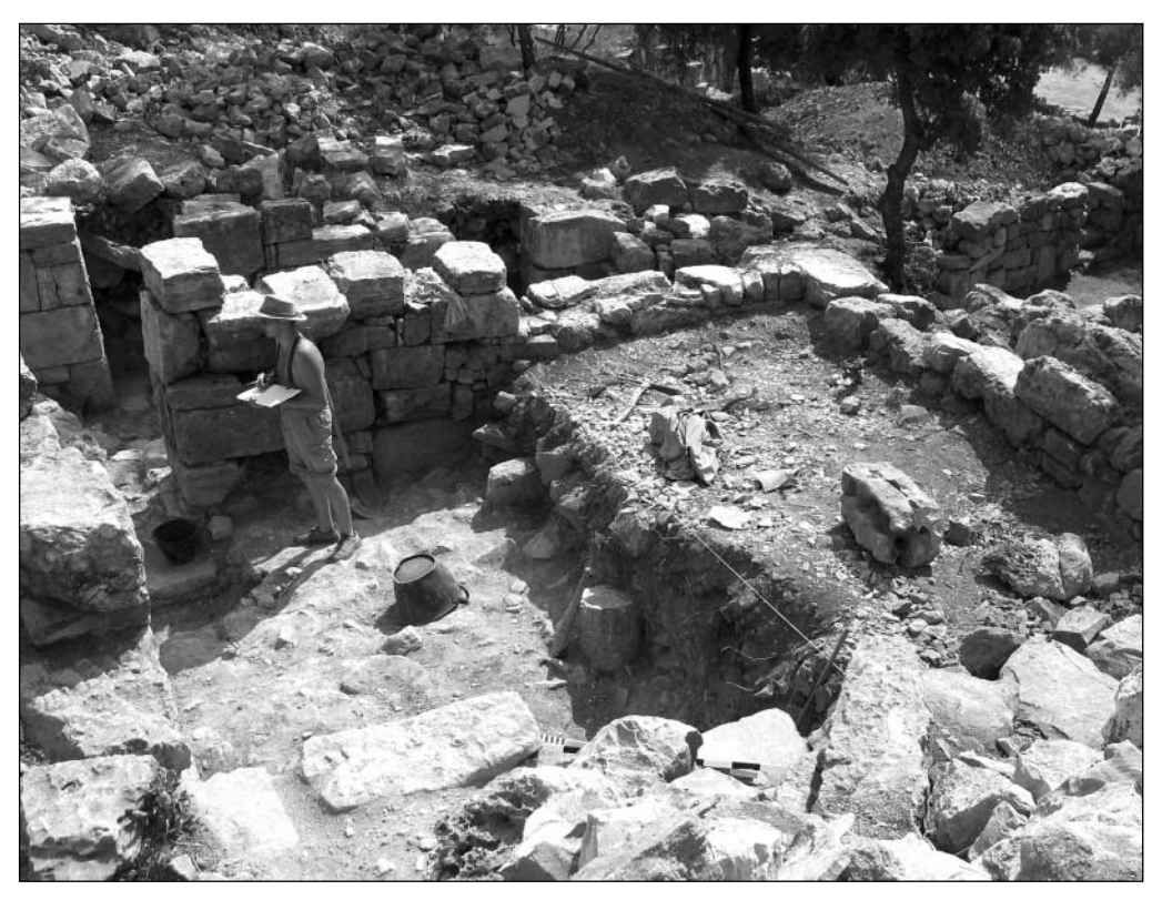
Fig. 6. View of room E.XXVI during exploration

The eastern part of room E.XXVI was explored. It proved to be an irregular rectangle (c. 6.50 x 4.90 m), attached to the west wall of Oil Press E.II. A thick layer (1.20-1.50 m deep) of tumbled blocks filled it ( Fig. 6). These blocks