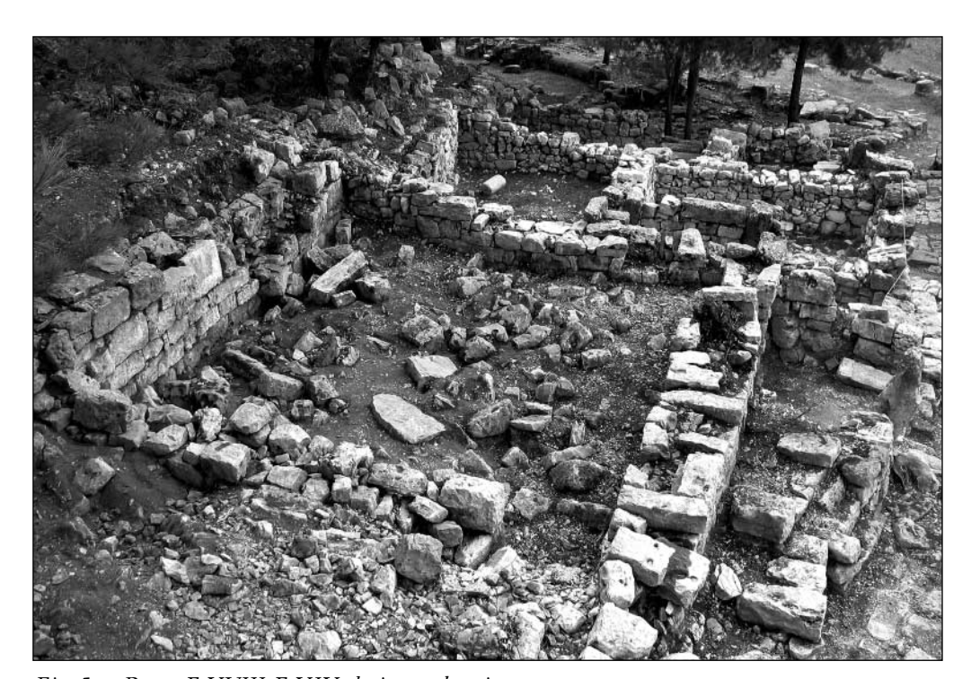
Fig. 5. Rooms E.XVIII-E.XIX during exploration

end of street E.XXV. Its eastern section, running to the intersection with street E.XXIX, was excavated already in 2002.<sup>4)</sup> The remains of a rectangular structure