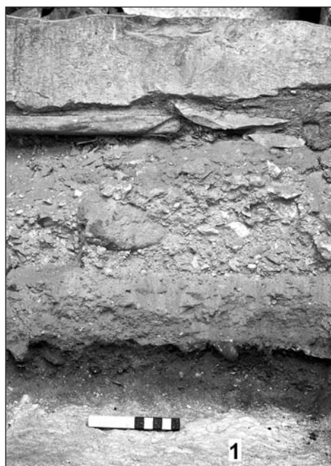
Fig. 3. Powdered limestone (1) in the west part of the entrance corridor trench

the thick mud-brick wall in the foreground in this view belonged to the sleeping area of the Coptic hermitage installed inside the tomb). Both jambs were cut in the rock. The width of the right one (0.90 m at the bottom, 0.60 m at the highest point) was greater than that of the left one (0.65 m at the bottom, 0.54 m at the highest point). The chamber was an irregular rectangle in shape, drawn out slightly on a north–south axis. The walls at the bottom measured: 5.45 m on the north, 6.05 m on the south,