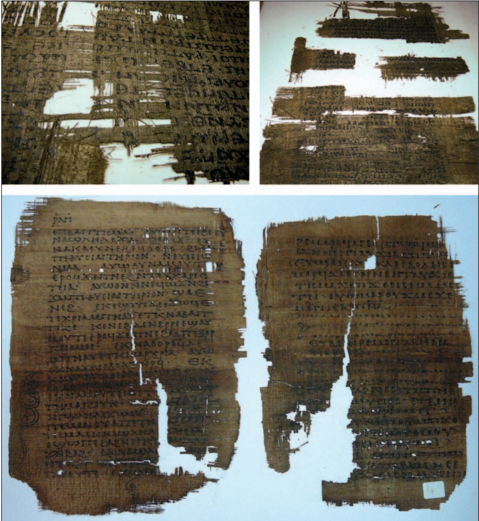
Fig. 3. Damaged inner areas: cracks and losses ( Encomium , top left; Canons , bottom) and fragmented leaves ( Encomium , top right)

burned the parchment [see Fig. 4]. Some leaves showed severe surface dirt. Fourteen leaves had been temporarily secured with Neschen tape. The wooden boards were in poor condition, the inside of the boards having rotted.