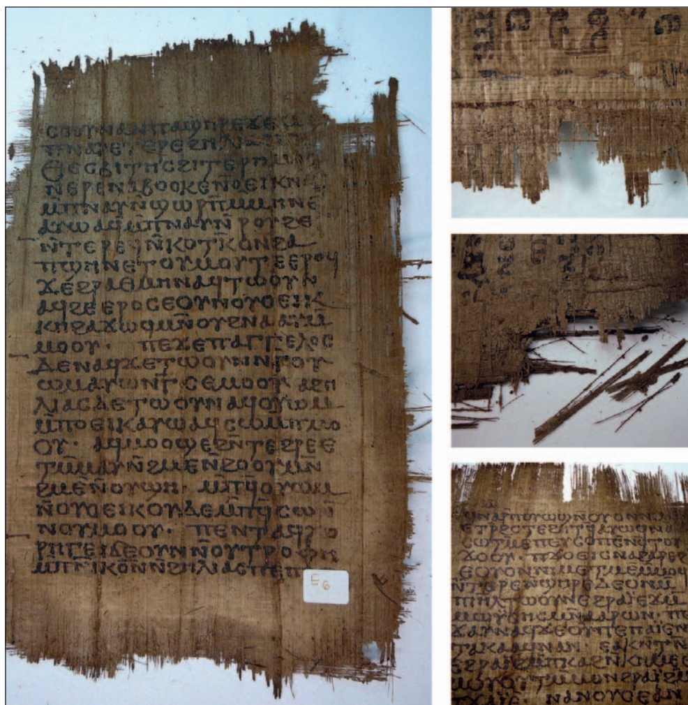
Fig. 2. Condition of the papyri: brittle edges of leaves, numerous tears and breaks (especially the Encomium 78,10); changing color, especially at the top edge (especially the Canons)

The parchment was extremely thin, fragile, brittle and stiff. Yellow discoloration (also orange), caused by fungi growth, occurred in many areas on about half of the leaves