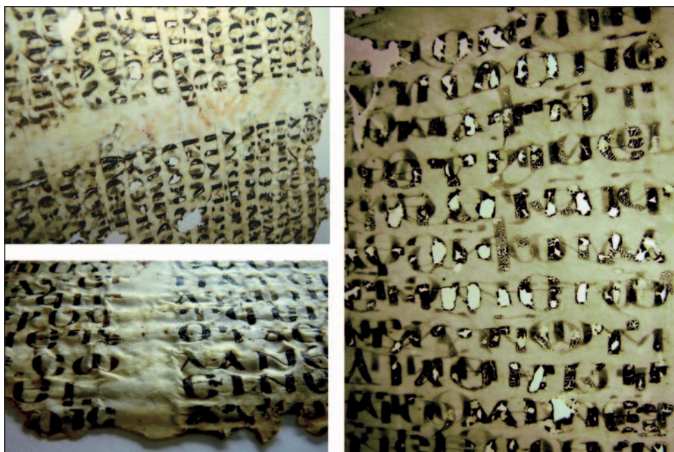
Fig. 4. Condition of the parchment codex: yellow discoloration (also orange) resulting from fungi activity (top left), cockled and distorted leaves (bottom left); severe iron gall ink corrosion causing loss of text areas and burning of the parchment (right)

A method of sizing papyrus leaves with methyl cellulose, 1% (with a disinfectant), using an aerograph was developed. This method was tried on one of the manuscripts (22 bifolios and the boards of the binding of the Canons, as well as the binding of the Encomium). Loose fragments and cracks were secured with Japanese tissue and