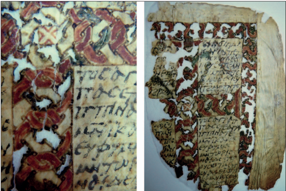
Fig. 5. Book of Isaiah, parchment leaf no. 48, ornament in the form of a cross — after restoration; all gaps filled in with thin Japanese tissue; left, close-up of part of leaf no. 48 after treatment

Leaf no. 48, with an ornament in the form of a cross on one side, and with