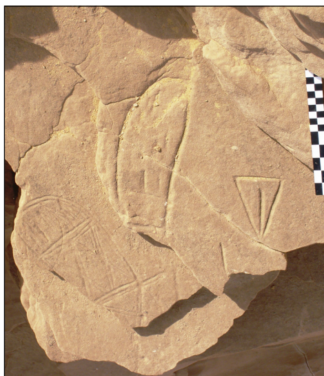
Fig. 5. Two sandals and a pubic triangle in juxtaposition from site 6/09

Another recorded motif, although not as numerous, is the so-called pubic