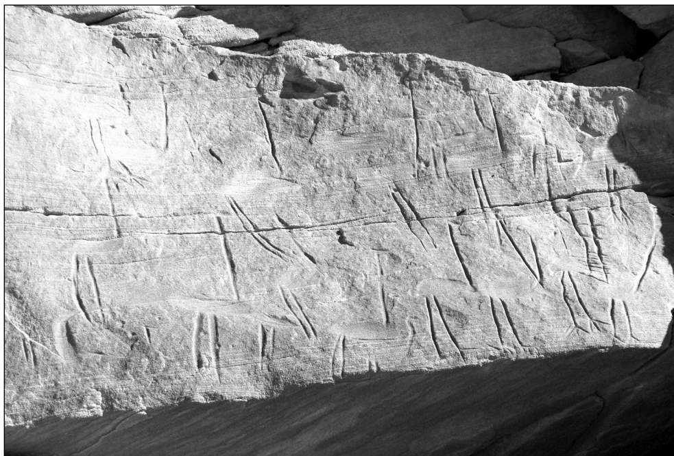
Fig. 2. Panel with ostrich depictions on site 6/09 (contrast enhanced)

Some figures potentially belonging to the Neolithic horizon can be seen also higher up on the cliff. The morphology