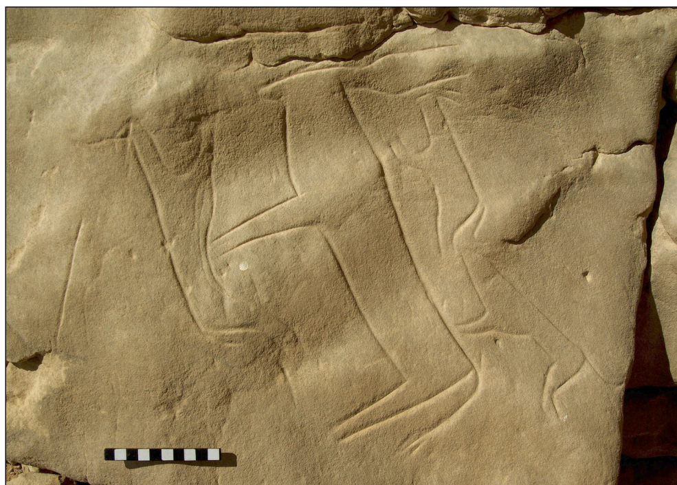
Fig. 11. Bovid chased by dogs