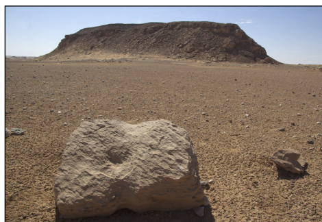
Fig. 12. Tethering stone in the vicinity of the site

A detailed documentation of Winkler's site 62 is only the beginning of a bigger project for the full recording of sites that the German scholar reported in a preliminary publication (Winkler 1939). Sites 66 and 67 have already been relocated, but their actual ranges will be determined in a forthcoming season. Site 66 is a single hill, but site 67 appears to be a conglomerate of many hills, which are yet to be identified.