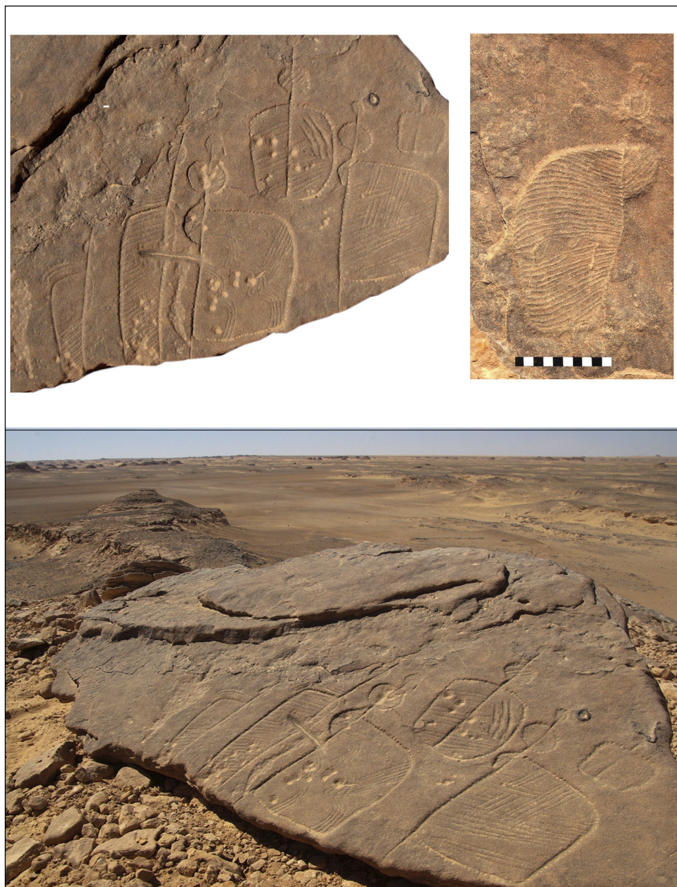
Fig. 7. Block at the top of Winkler's site 62; top left, close-up view of a group of six anthropomorphic figures; top right, individual 'female' figure