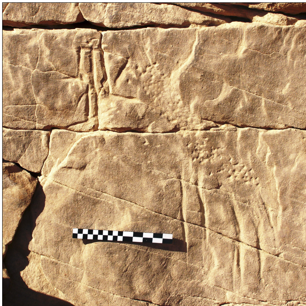
Fig. 3. Giraffe and anthropomorphic figure on the northeast wall of hill 6/09

whole. Foot and sandal images, of which there is more than 30 examples, are the commonest type. All were engraved on horizontal surfaces, sometimes in clusters, but more often as single images, never however as a pair (left and right shoe/foot executed in the same style). The foot/sandal motif is well known from the Eastern Sahara and the Mediterranean