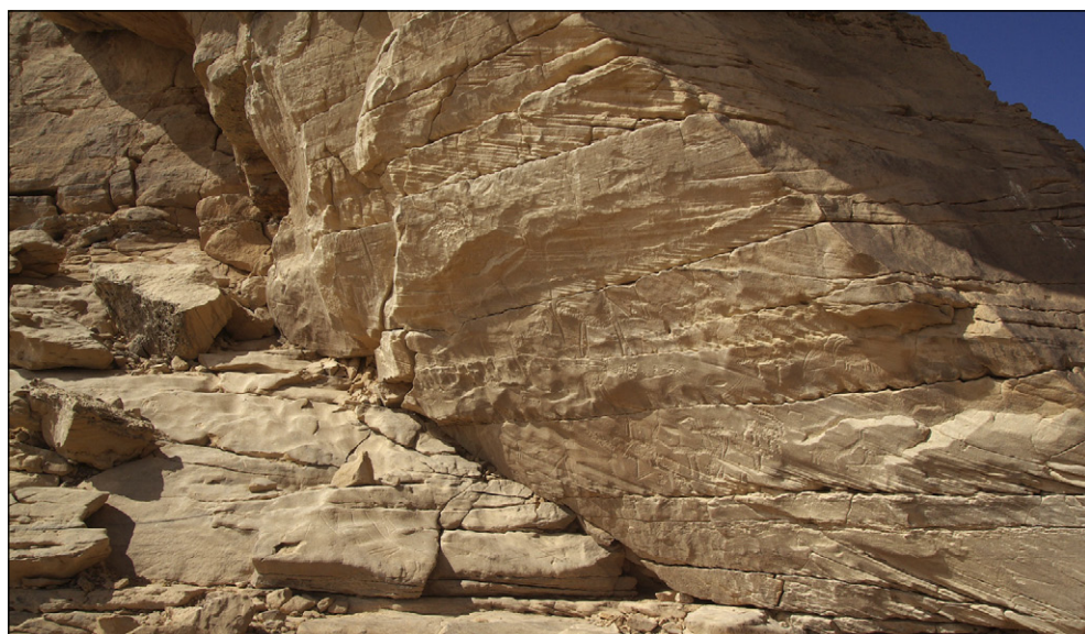
Fig. 8. Vertical panel covered with petroglyphs at Winkler's site 62

Another cluster of rock art appears on a vertical wall facing east, located on the northeastern side of the hill under discussion [ Fig. 8 ]. It is a solid surface measuring about 5 m by 4 m and covered with dozens of petroglyphs, mostly of animals, appearing singly as well as in micro-scenes, consisting primarily of rows of specimens proceeding in one