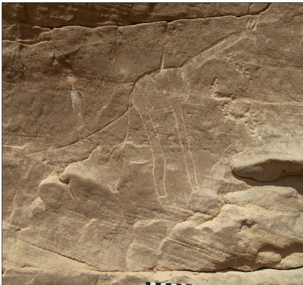
Fig. 9. Giraffe and anthropomorphic figure connected by a line

Two of the scenes merit special note. A giraffe is depicted in one case, executed in sunken relief with unusual, geometrically stylized legs. An arched line cuts across the back of its body, carved most probably earlier than the giraffe.