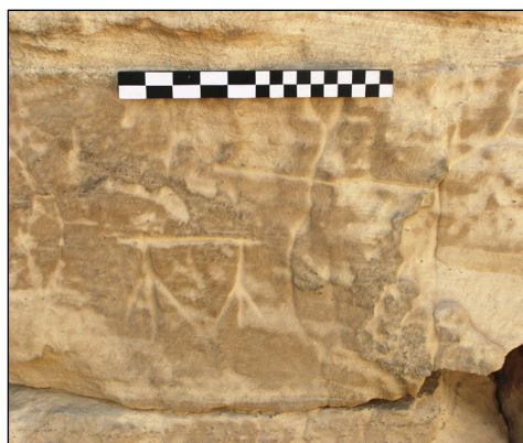
Fig. 6. Tribal mark(?) located high on the north-east side of the cliff on site 6/09

The younger time horizons are represented by relatively large numbers of geometric motifs (squares, rectangles, different configurations of lines). Their