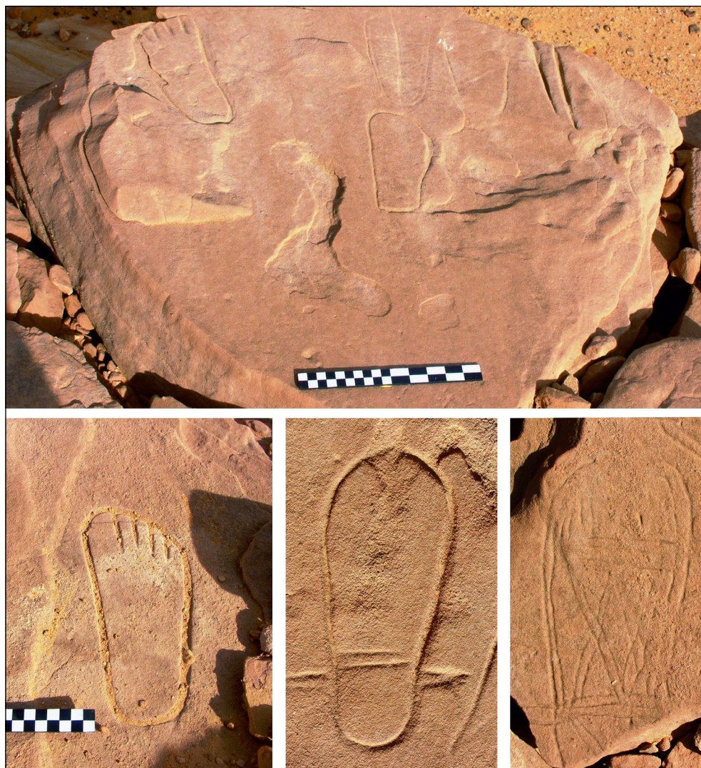
Fig. 4. Foot and sandal depictions from site 6/09: top, panel with foot and sandals in outline executed in different styles; bottom left, foot representation; bottom center, sandal with heel and straps depicted; bottom right, sandal with straps inside

art remains a matter of debate (Verner 1973: 13–56). Červiček dated some of the sandal petroglyphs to Horizon C (2100–1400 BC), but most of them to Horizon E (1050 BC–AD 250, Červiček 1986).