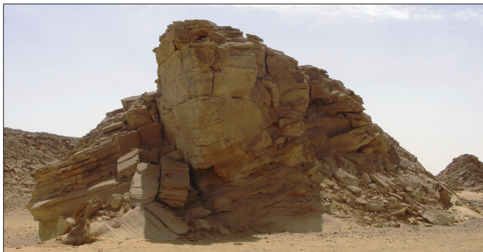
Fig. 1. Site 6/09, view from the north

Middle/Late Neolithic or Old Kingdom. 1 They occupy long smooth panels facing northwest, relatively high up on the steep northern cliff, making them impossible to trace. A combined technique was employed in their execution, the bodies of the ostriches being abraded to resemble sunken relief, the legs and necks of figures