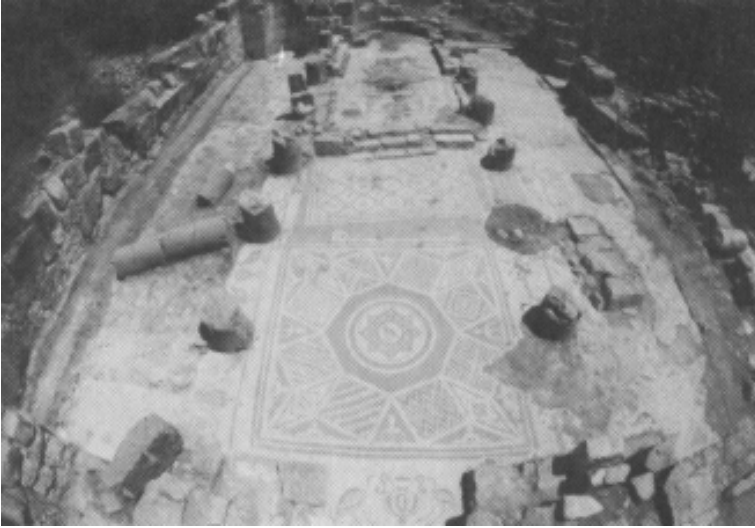
Phot. 1. Basilica, general view.

Most of the mosaics are geometric. A composition of polychrome lozenges and squares enclosed in a border of leaves was found in the southern aisle. A panel in the western part of the nave contained geometrical figures concentrically arranged around a bird representation in the centre. Another mosaic panel, originally surrounded by a chancel screen, marked the space that was reserved for the clergy in front of the bema. Representations of birds and a variety of vessels filled the spaces between the columns. The mosaic in the sanctuary comprised a central panel decorated with a magnificent depiction of a lioness, surrounded by water-birds, fish, baskets brimming with bunches of grapes (Phot. 2). The iconography of the mosaics reveals many common features with the other churches of the Byzantine province of Phoenicia, the complexes in Zahrani and Ghiné constituting good examples.