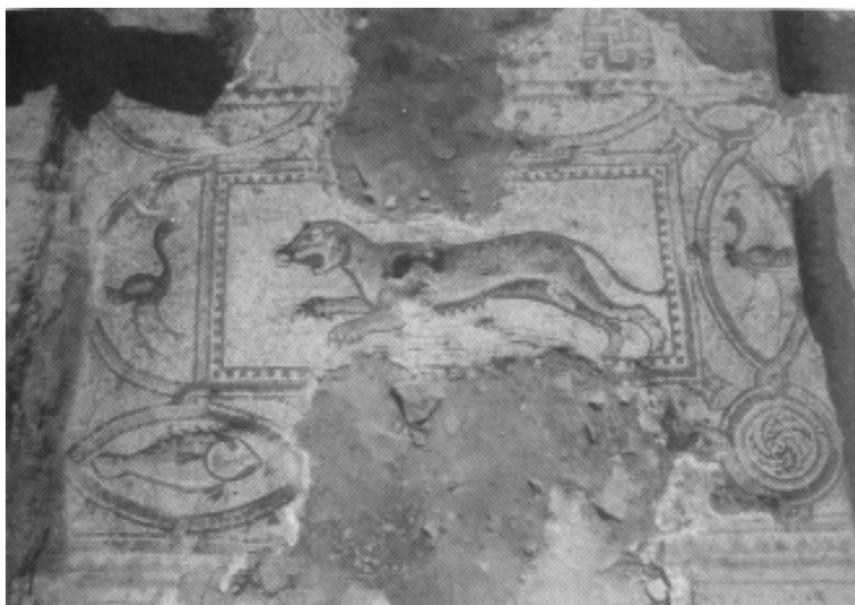
Phot. 2. Basilica, fragment of a mosaic with a depiction of a lioness.

Important evidence of remodeling in the sanctuary, that is, the dismantling of the chancel screen and the blocking of spaces between the columns, presumably corresponds to changes in the liturgy.