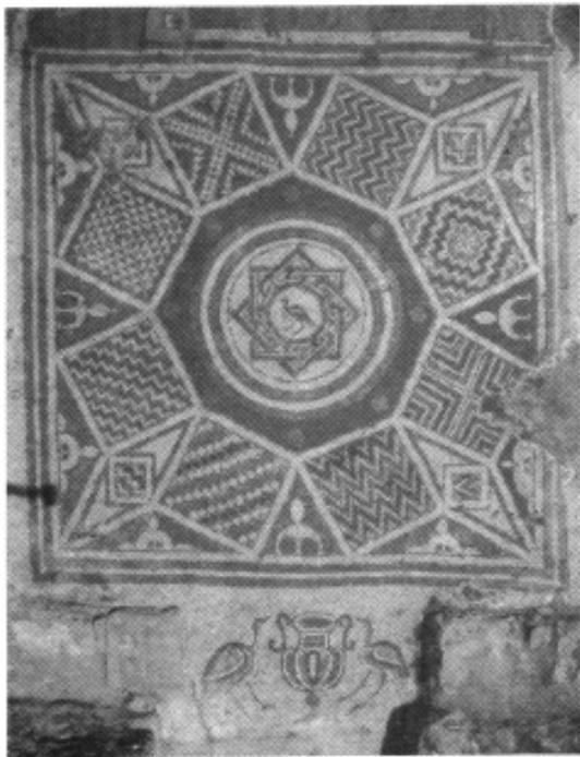
Phot. 3. Basilica, mosaic in the western part of the nave.