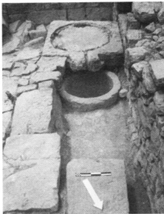
Phot. 4. Oil-press complex E.1: northern press.