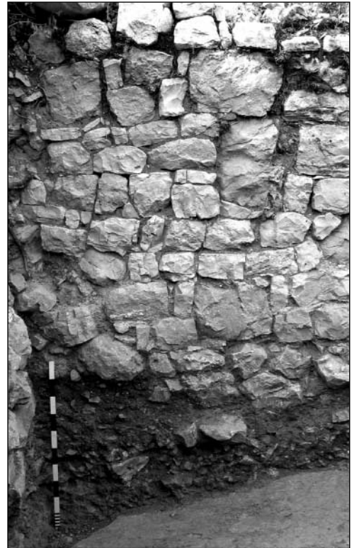
Fig. 4. Section through the stratigraphy in the northwestern corner of E.XVI

Room E.XVII (4.00 x 4.10 m), which adjoins E.XVI from the north, was excavated in 2002. This year a trial pit was dug in the northeastern corner and revealed two layers beneath the Roman-period floor. The younger one contained Roman and