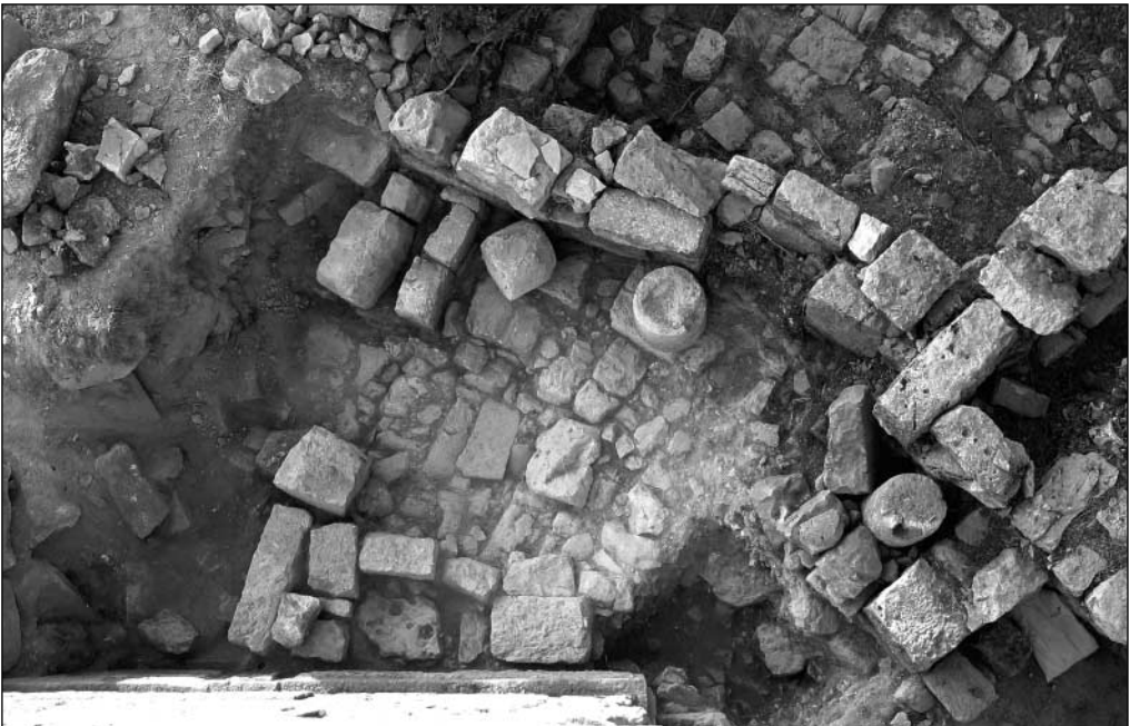
Fig. 3. View of the trial pit by the north corner of the Roman temple

a meter-thick layer of modern fill (cf. Fig. 1 ; Fig. 3 ). The function of these four limestone steps appears clear. The steps are c. 0.90 m wide with side walls on the