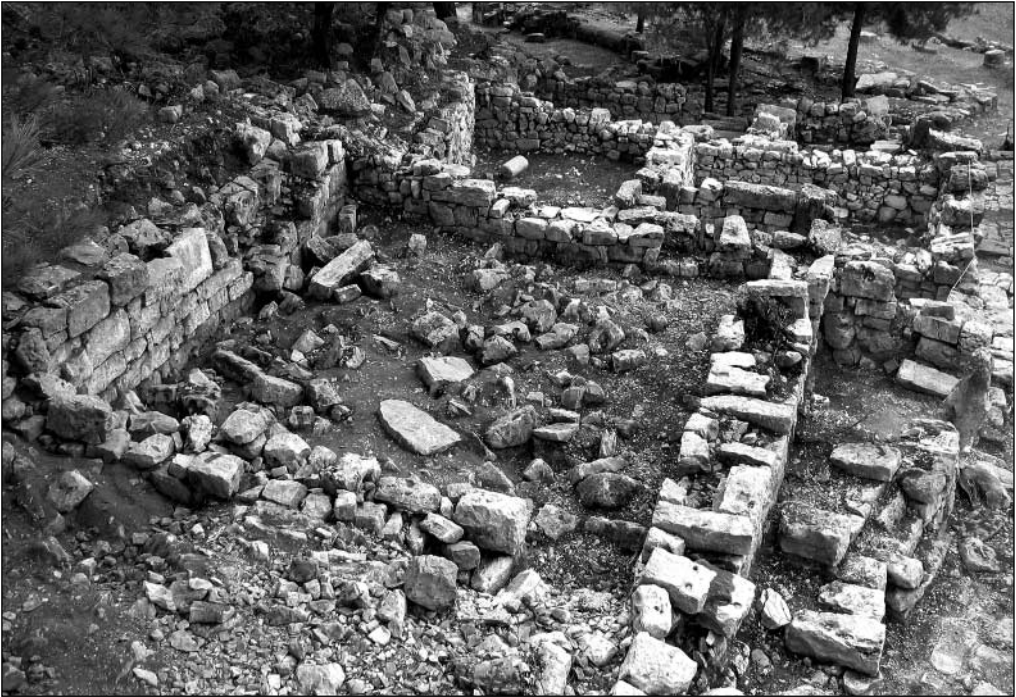
Fig. 5. Rooms E.XVIII-E.XIX during exploration

end of street E.XXV. Its eastern section, running to the intersection with street E.XXIX, was excavated already in 2002. 4) The remains of a rectangular structure