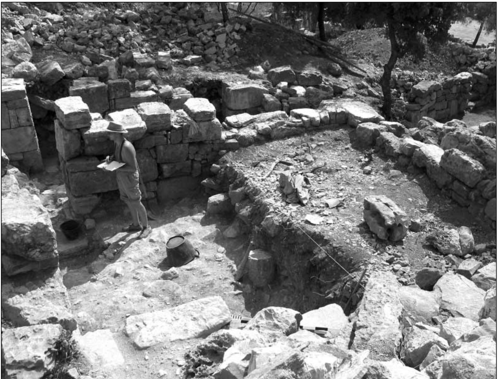
Fig. 6. View of room E.XXVI during exploration

The eastern part of room E.XXVI was explored. It proved to be an irregular rectangle (c. 6.50 x 4.90 m), attached to the west wall of Oil Press E.II. A thick layer (1.20-1.50 m deep) of tumbled blocks filled it ( Fig. 6 ). These blocks