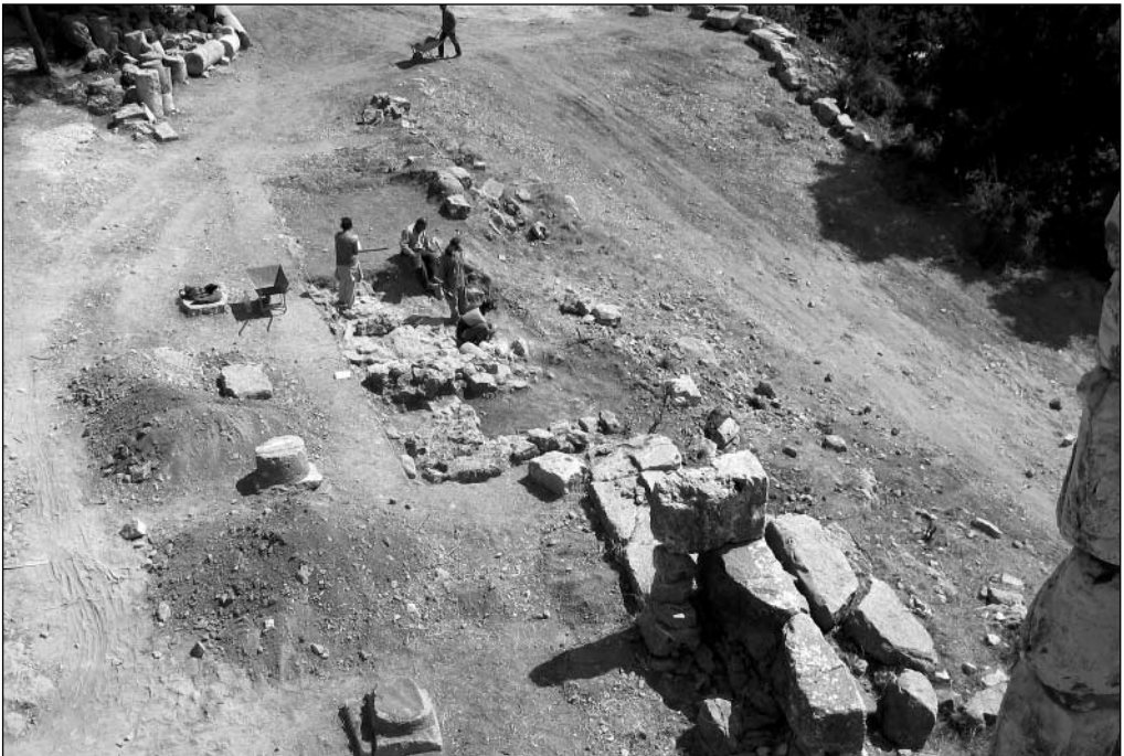
Fig. 2. Structures discovered in the court in front of the Roman temple, view from the northwest

Two walls of c. 0.90 m width were attached to the south side of this structure. They constituted reinforcement of the portico wall or, equally likely, formed small rooms. In either case, they buttressed the portico on the side of the escarpment. Their connection with the neighboring