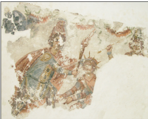
Fig. 2. Transfer of the Mithra scene from layer 1, now a separate panel on exhibition