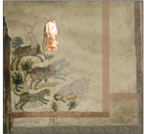
Fig. 1. Example of digital reconstruction work: Fragment of hunting scene from the southwestern corner of Room A in the Mithraeum (left) and proposed digital reconstruction