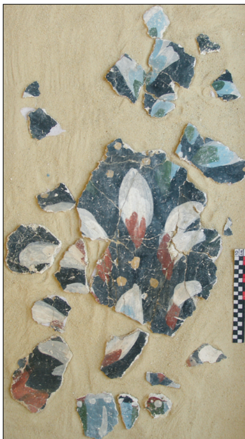
Fig. 4. Fragment of a floral motif from layer 5 (left) and from underlying layer 2, painted in different style