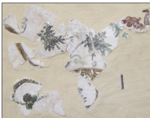
Fig. 5. Assembled fragments with grapevine and inscription from the ceiling from layer 2 (left) and from underlying layer 1, painted in different style