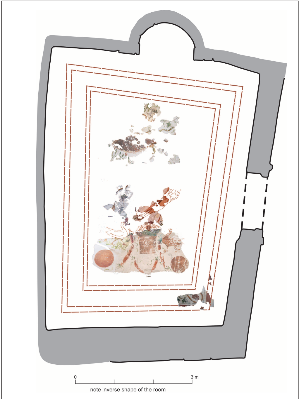
Fig. 5. Possible arrangement of the ceiling composition (Interpretation and processing D. Zielińska)