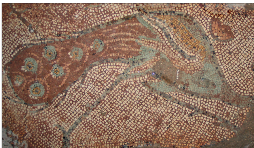
Fig. 4. Reconstructed peacock motif and parallel from a mosaic from Apamea (Museum in Qalat el-Mudiq) (Photo C. Calaforra-Rzepka; processing D. Zielińska)