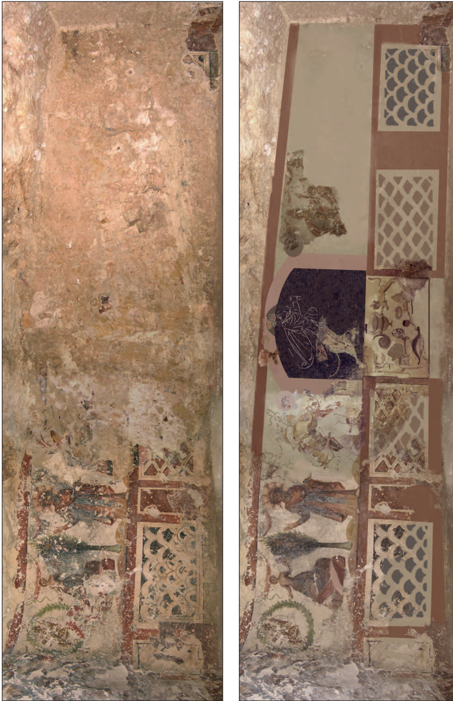
Fig. 3. The east wall of Room A, present view (top) and reconstruction of the painted decoration (Photo C. Calaforra-Rzepka; processing D. Zielinska)