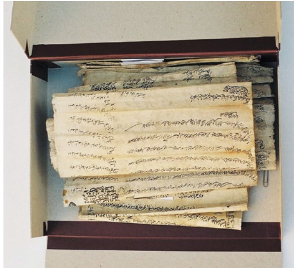
17th-century Waqf document after conservation. AUB. ▲