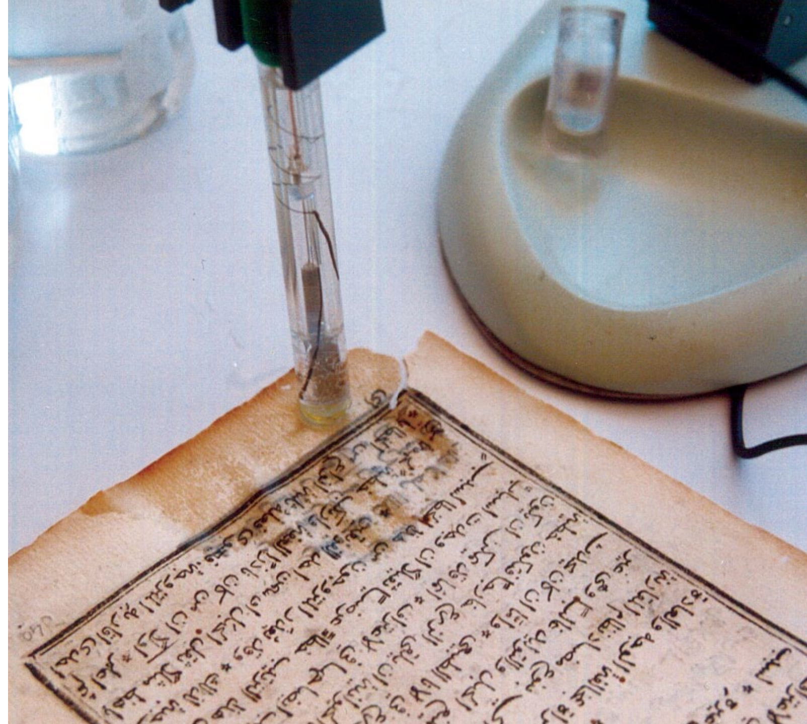
Analysing the acidity of paper in a historic book. National Archives Centre.