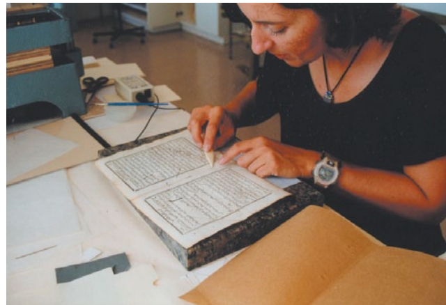
Filling losses in the pages of a printed text dating from 1797. National Archives Centre.