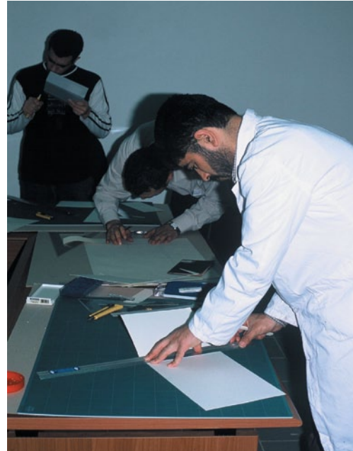
Staff training workshops at the National Library, Beirut 2003.